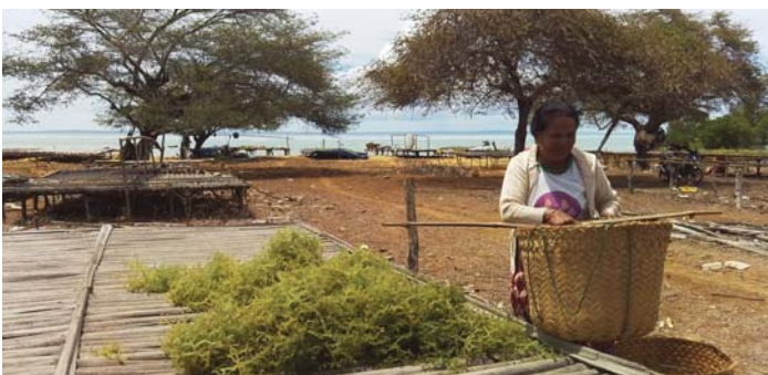
Seaweed Harvesting on Semau Island Photo: Indonesia

Semau Island, a small island located in the Sawu Sea, has been chosen as the target area for COMDEKS activities in Indonesia.