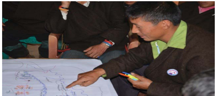
Workshop participants engaged in mapping exercise

Please click here to read more about our activities in Bhutan.