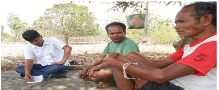
Community participation in baseline assessment

The island, a rich ecological habitat, hosts monsoon forest, and the surrounding sea is home to one of the worlds' richest coral reef covers, as well as dolphins, sea turtles, manta rays, and the endangered blue and sperm whales. In addition, there are fourteen villages on Semau Island. The communities living there depend mostly on agriculture and fishing for survival. Unfortunately, the island faces a disproportionate risk to the agriculture practices on which local communities depend, and to its rich biodiversity due to climate change and extreme weather variability. The island faces growing threats given a diminishing fresh water supply, as well as threats from excessive use of chemicals in farming which decreases soil fertility and pollutes the surrounding oceans.