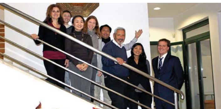
Indicators Toolkit Workshop in Rome