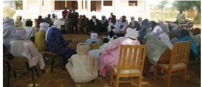
Consultation outside Tabalak municipality

Tabalak lake is facing threats of accelerated degradation of natural resources due to pressure from human activities and climate change. Additionally, high incidence of poverty, and poor sanitation services, a poorly developed waste collection system, and lack of latrines all contribute to serious health hazards in the region.