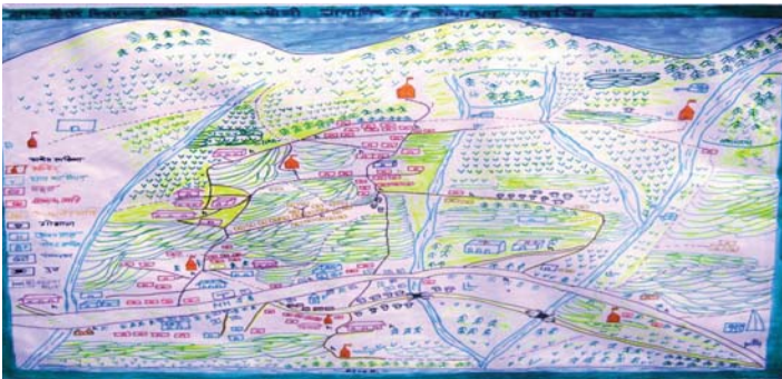
Village map produced during the community consultation Photo: India

The community consultation and village mapping exercise, together with the Resilience Indicators piloting exercise, successfully engaged stakeholders to determine the resilience of the landscape and inform the design of the COMDEKS Country Programme Landscape Strategy in India. Village Mapping is a crucial building block of the social capital required to sustain participatory landscape management