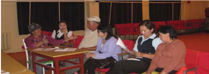
Community consultation process

In Mongolia, a large central part of the country known as the Central Selenge region, stretched across 628,856 ha of forest and mountain ecosystems, has been selected as the target landscape for COMDEKS projects. This area, home to a diverse ecosystem of plants and animals, including bears, lynxes, foxes, and wolves, is currently under pressure from a combination of factors including forest and water source depletion, pollution, and the effects of climate change. As humans continue to rely on unsustainable lumber extraction and the effects of livestock grazing, these regional issues are intensified. Additionally, as a region crippled by widespread poverty, the environmental deterioration of the region has had disproportionately serious consequences for the local population.