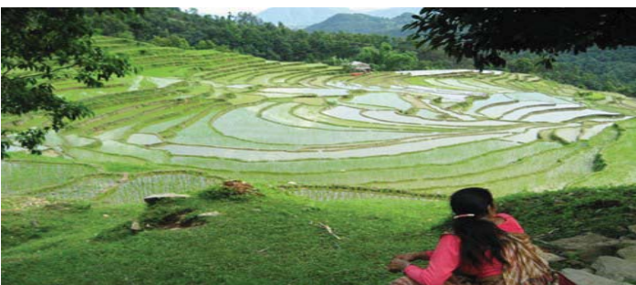
Rice Terraces in Nepal

Please visit the Bioversity International website to read the full article, and access the presentations from the seminar.