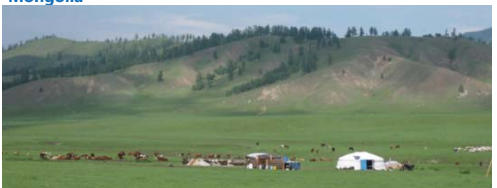
Central Selenge region